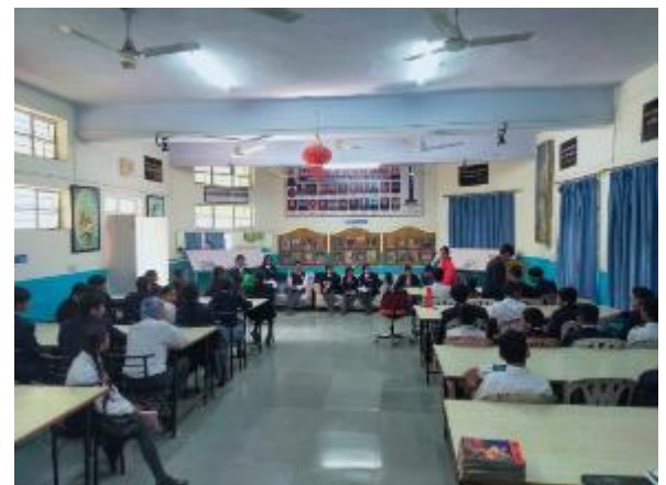
TALK SHOW ON FAMOUS PERSONALITIES