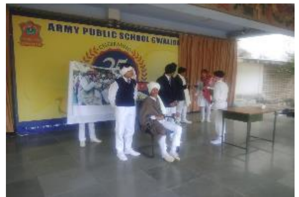
MORAL STORY ENACTMENT