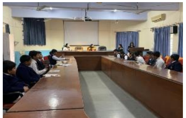
JUST A MINUTE PUBLIC SPEAKING ACTIVITY