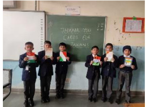
THANK YOU CARD FOR JAWANS