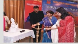
EDUCATIONAL TRAIL 2022-23