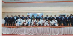
STAIRS FOUNDATION STATE KARATE CHAMPIONSHIP