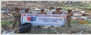
PUNEET SAGAR ABHIYAAN