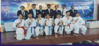
5TH CHAMPIONSHIP OF CHAMPIONS ALL INDIA INVITATIONAL KARATE