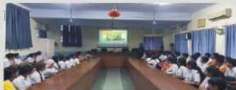
GUEST LECTURE ON KARGIL VIJAY DIWAS