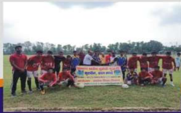
SUBRATO MUKHERJEE FOOTBALL TOURNAMENT