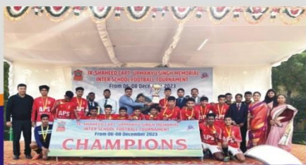
IX SHAHEED CAPTAIN UPMANYU INTER SCHOOL FOOTBALL TOURNAMENT