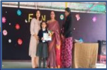
INTERNATIONAL MOTHER LANGUAGE DAY