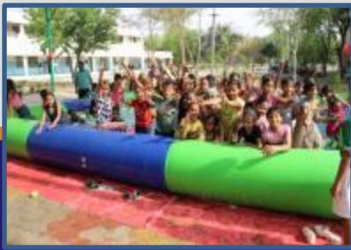
KIDZANIA SUMMER CAMP