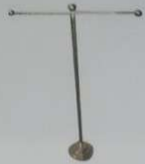
T Stand Flag