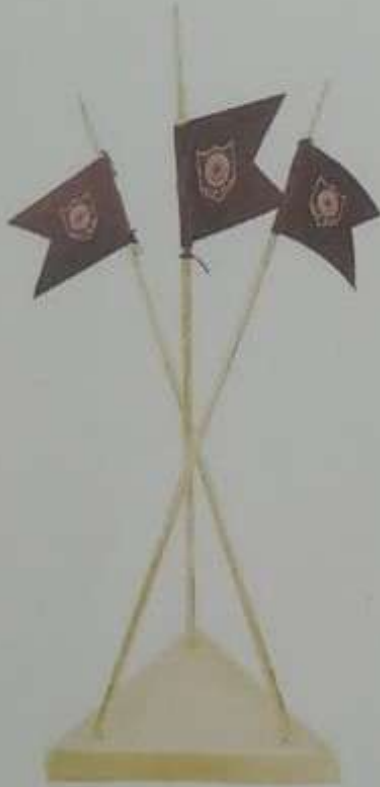
Sample of Lancer flag- 03 Flag in one lancer