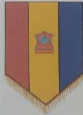
Sample copy of APS Gwalior Flag