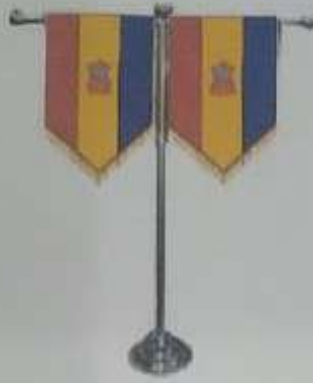
T Stand with Flag