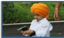
PATRIOTIC DRESS COMPETITION AT APS GWALIOR