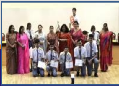
PRESIDENT AWWA ROLLING TROPHY ETHICS BOWL COMPETITION