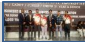
SENIOR NATIONAL KARATE CHAMPIONSHIP