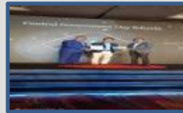
EDUCATION WORLD INDIA RANKING_AWARDS