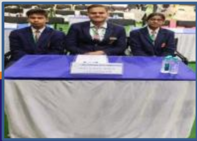
CBSE HERITAGE INDIA QUIZ 2024