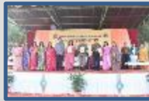
ANNUAL SPORTS DAY: SPORTSTACLE 24