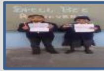
SPELL BEE ACTIVITY